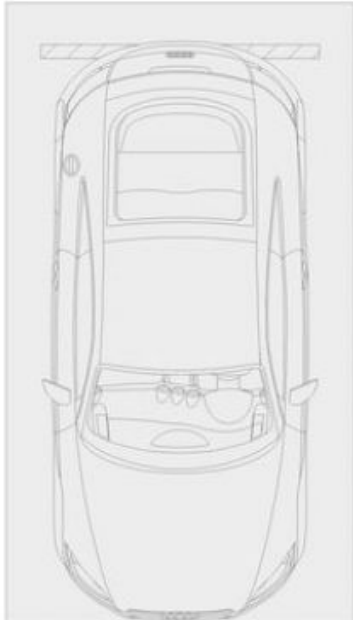
Car-space x 1